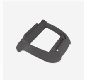
Base for the control unit