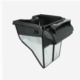
Filter canister Simple filter 100 µ